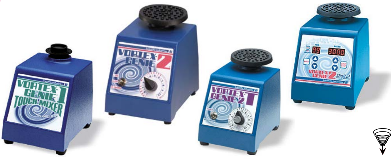
Robust and universal Vibration shaker with a wide range of media combinations to suit the container being shaken.