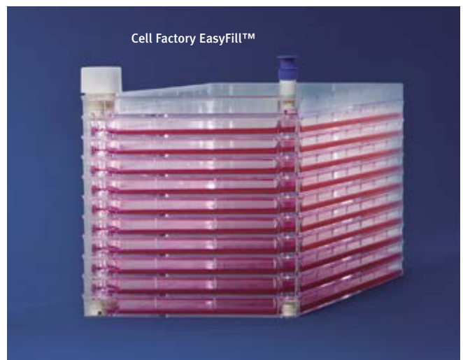
High density Cell Factory