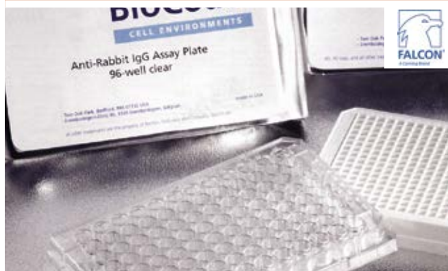
Flat-bottom polystyrene plates