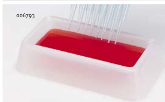
*V-shaped bottom along the inner edge *V-bottom from 18 mm (from the top of the inner edge of the tank)