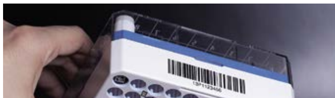
Cryogen Box 2D bottom: 2D barcode and openings*