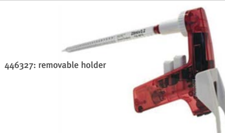
446327: removable holder