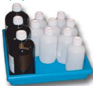
Polypropylene drip tray