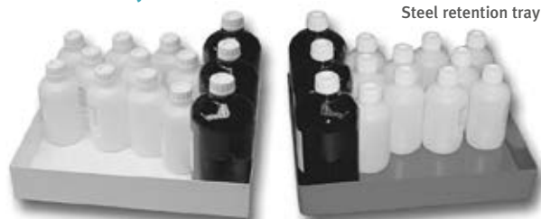
Steel retention tray