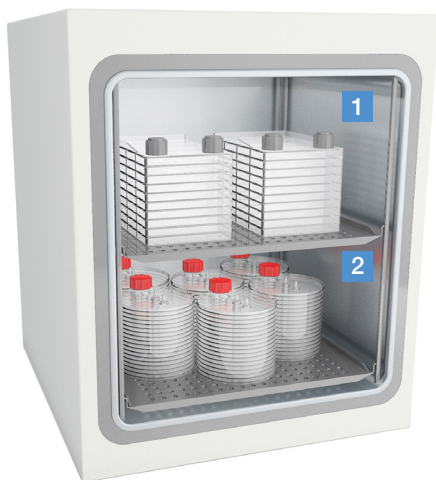
Fig. 1: Standard incubator, e.g. HeraCell 240 (Thermo Fisher Scientific) Incubator size internal dimensions: W 56 cm, H: 67 cm